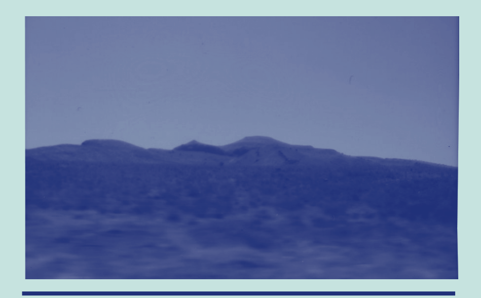
Essay and photo by Hanan Benammar

There is always a system behind the idea of naming things, places and even people. A scientific system, a structure, a classification, a clarification; a way to make sense out of unknown substance. An onomatopoeia, a sound that is not distinguishable. A "Bar-Bar" sound, something that does not make sense in your own language. A substance you are carrying with you, within you.